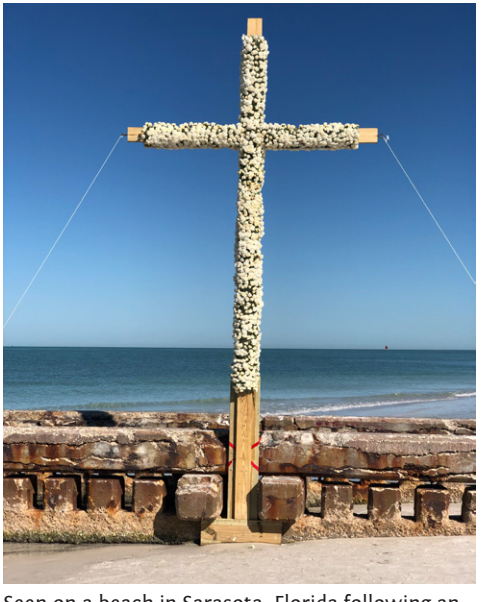
Seen on a beach in Sarasota, Florida following an Easter Sunday Sunrise service. Lovely cross covered in white flowers. Very serene. Very peaceful.

The March for Life UK will take place on Saturday 11 May starting outside Westminster Church House, 25 Great Smith Street, London SWIP 3BN at 2.00 p.m. There will also be events in the morning from 9.30 a.m. until 1.30 p.m., for more details see www.MarchforLife.co.uk