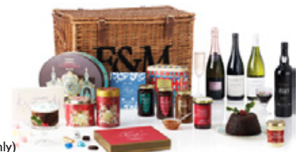
(hamper shown is for illustration only)