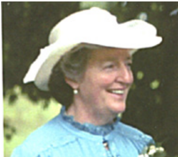
May she Rest in Peace and Rise in Glory and Grace